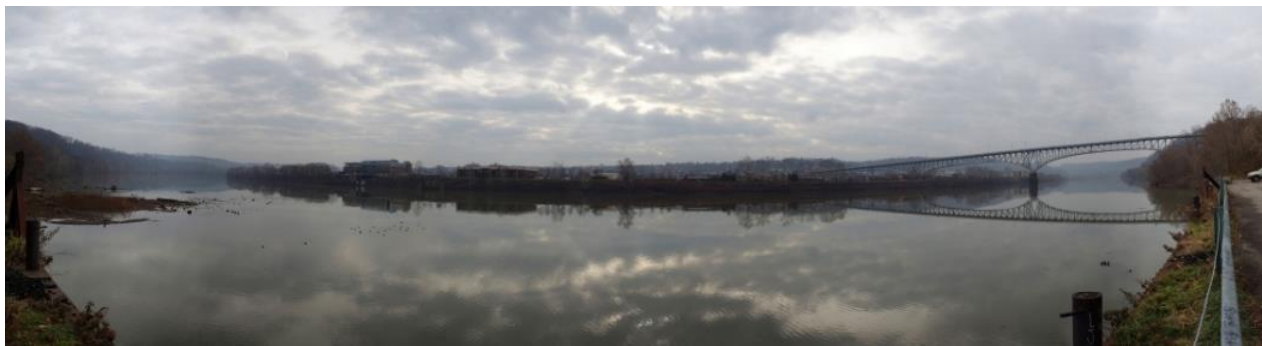
Monongahela River and Homestead from Duck Hollow