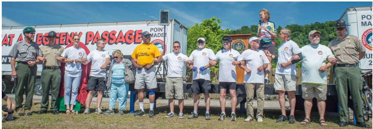
The leaders and representatives of the various trail groups help form the human chain of the GAP. Photo by Paul g. Wiegman and can be found on the GAP Facebook Page. http://tinyurl.com/kg6qe7n